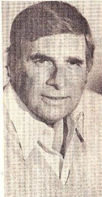
Gene Roddenberry, who created the "Star Trek" television series and is producer of the "Star Trek" film.

Trek" characters and situations rather than the hardware that created a cult of millions of viewers during the years from 1966 through 1969, when the televi-